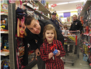
Shop with a Cop FOP 106 & K-Mart