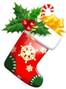
Shop with a Cop FOP 114 & Wal-Mart